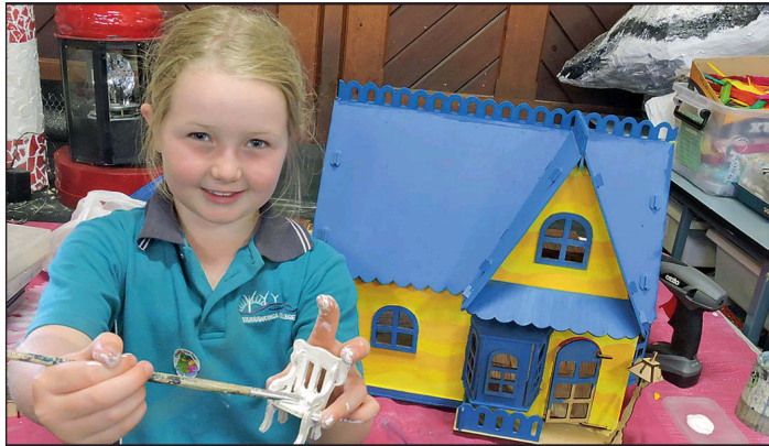
The 2016 Community Workshop exhibition will literally be a sea of colour, creativity and craft.

More than 530 Yarrawonga College P-12 students from Prep through to year 8 have contributed to the exhibition which will open on Tuesday, November 29 at 12pm with the official ceremony held at the Yarrawonga Uniting Church Hall and the actual exhibition displayed in the multipurpose room of the junior campus.