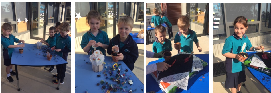
The Preps decorating their pots and planting flower bulbs to send home to their parents to say 'Thank you for helping us to grow!'

Check out these great photos of our Preps potting plants and creating lovely little Thank You gifts for their parents. We all really appreciate the efforts of our parent community during the Remote Learning for most of this term. Other units recognised and thanked parents with lovingly made cards, art pieces and decorated pots. Great work kids! And thanks again, parents!